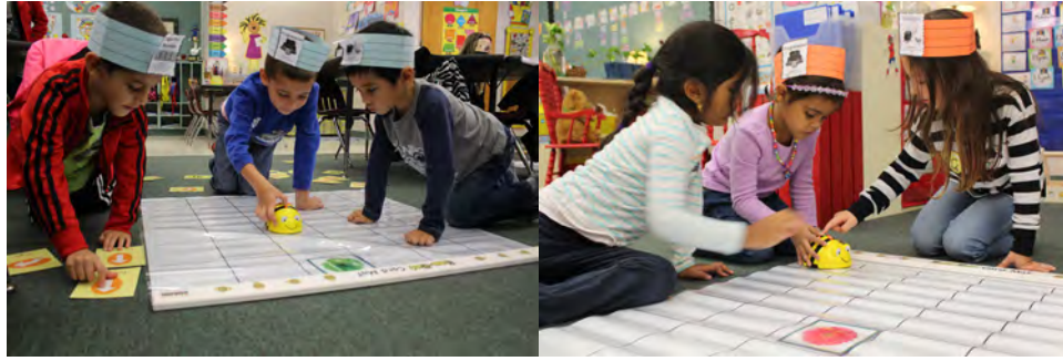
Photos: Ms. Neal's kindergarten class at Woodlands Elementary participating in a coding lesson with the Bee-Bots.